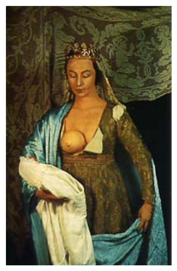
Fig. 1: Cindy Sherman, Untitled #216, 1989

pendulous breasts, Opie portrays herself (literally warts and all) as she nurses her infant son in a provocative, yet tender, depiction of maternity.