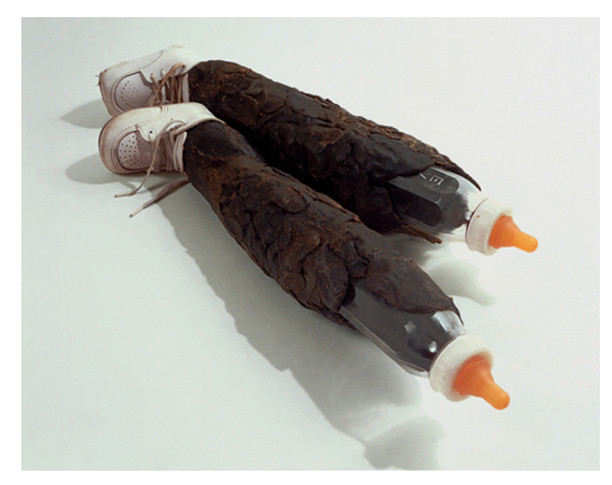
Fig. 5: Rona Pondick, Baby, 1989

Malbert goes on to assert that: 'the isolation of the udder — or breast — in Cross' assemblages signifies the separation of the body from the head, the suspension of rational thought that is supposed to accompany motherhood.'<sup>xxiv</sup>. Cross rearranges bestial glands with morbid opulence. The texture of a cow's udder is soft and cushy at first, but it dries hard like forbidding armour. Therefore great tension registers in the work between the quintessence of caring and mindless gentleness, cohabiting with the violence of butchery.