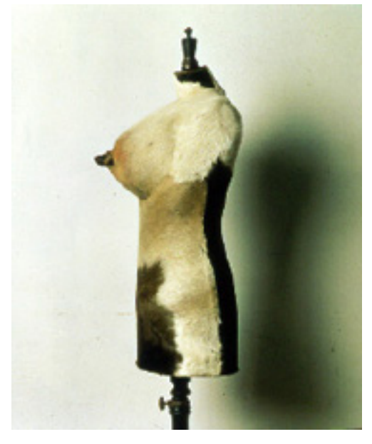
Fig. 4: Dorothy Cross, Amazon, 1992

this 'saintliness' is power . Man-made, paternal rules made implicit in the mythological status of the Madonna, creating an impossible status for real women to attain.